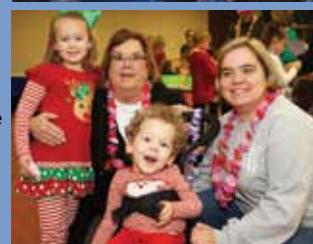
Kourageous Kids holiday gathering

Kourageous Kids patients include palliative and hospice care