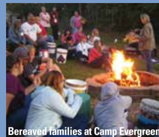
Bereaved families at Camp Evergreen

Grief Counseling Center in 2017 provided 3,563 counseling & 3,466 group sessions.